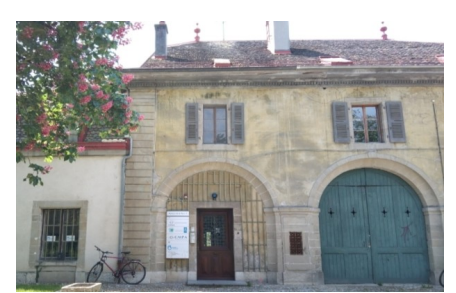
GMPA office at the historic 18<sup>th</sup> Century Villa Masaryk next to Place des Nations and UN Palais des Nations in Geneva.

Global Migration Policy Associates is an independent global expert group established in 2011 in Geneva with consultative status to the United Nations Economic and Social Council (UN ECOSOC) since 2015. GMPA is a dynamic space and place for ongoing rights-based, multidisciplinary, participatory research, policy development, advisory services, training-teaching, and knowledge- and values-based advocacy. It generates knowledge and analysis for a broad international articulation, promotion and realization of the rights-based approach . GMPA Associates and Affiliates are recognized academic and practitioner experts from countries in all world regions with rich experience in spheres of migration-related research, policy and governance. GMPA members reflect diverse academic and practical disciplines addressing multiple aspects of migration.